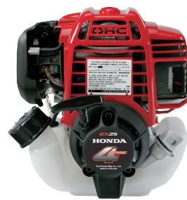
MINI 4-STROKE SERIES